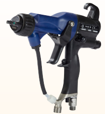
Pro Xp™ Air Spray Electrostatic