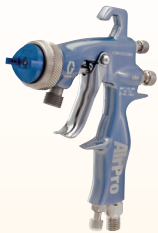
AirPro™ Conventional Gun