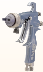
AirPro™ HVLP Gun