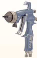
AirPro™ Compliant Gun